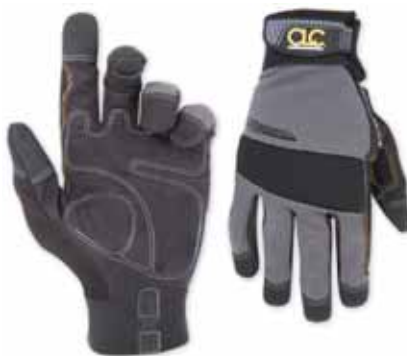
Model 125: Handyman™