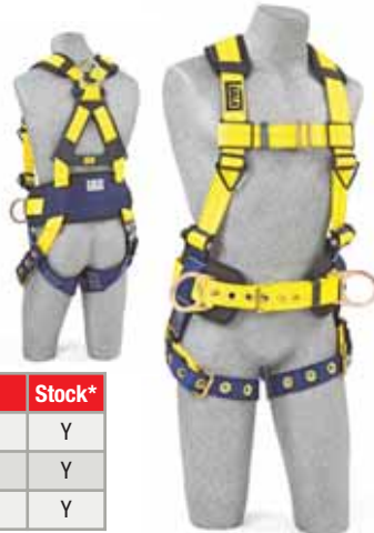
Full Body Harness with Back & Shoulder Pads, Back & Side D-Rings, Tongue Buckle Leg Straps