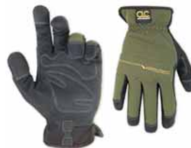
Model 123: Workright OC™