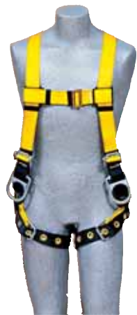
Full Body Harness with Back & Side D-Rings, Tongue Buckle Leg Straps