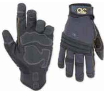
Model 145: Tradesman™