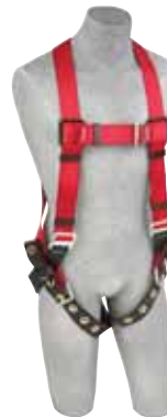
Full Body Harness with Back D-Ring, Tongue Buckle Leg Straps