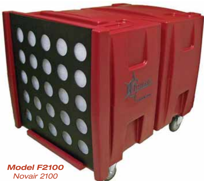
Model F2100 Novair 2100 w/HEPA filter