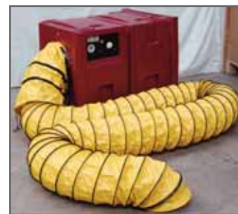
Novair 2000 can be used as a portable, self-con- tained duct system with optional ducting